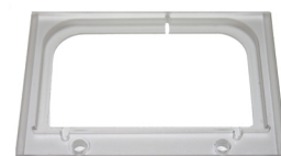
MSA-MECH1 Mechanical stage