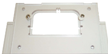
MSA-LEI/DM Leica DMIL