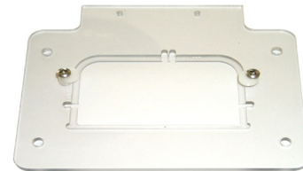
MSA-OP Nikon Optiphot