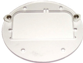
MSA-NIKD Nikon Diaphot 10.8cm