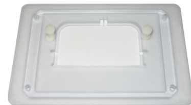
MSA-PR Prior automated stage