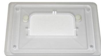
MSA-ZAX Zeiss Axiovert rect