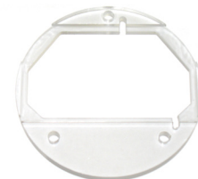
MSA-LEI/RD Leica round